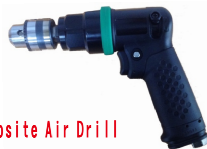
3/8" Composite Air Drill