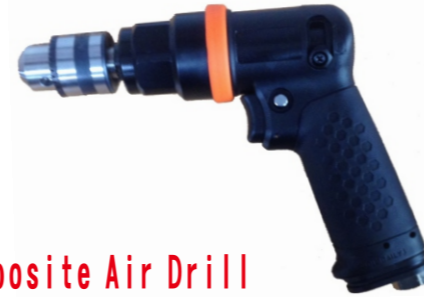
3/8" Composite Air Drill