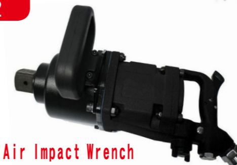
1-1/2" Air Impact Wrench