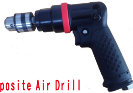
3/8" Composite Air Drill