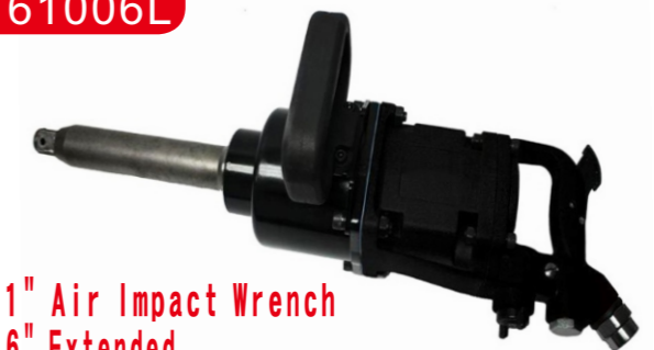
1" Air Impact Wrench 6" Extended