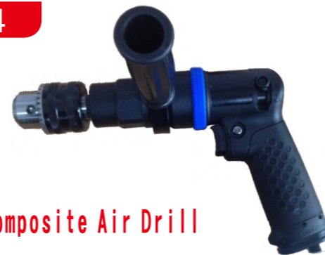
1/2" Composite Air Drill