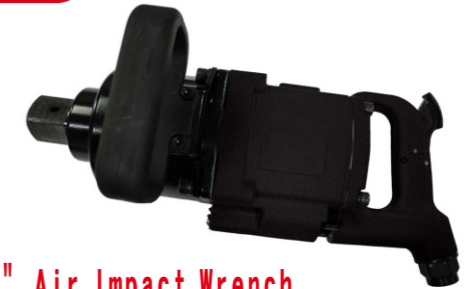
1-1/2" Air Impact Wrench